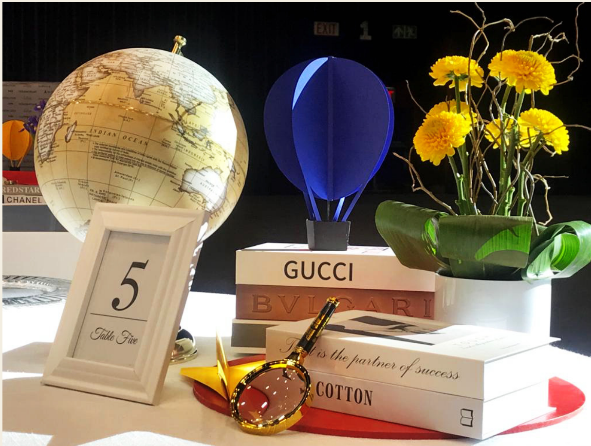
Table treatment and styling